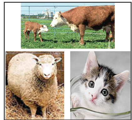
Cloned cows, sheep, and cats. Are humans next?

Thus, despite the UN’s wranglings, it still seems that time is on their side